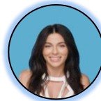
Teni Panosian Actress & Beauty Blogger