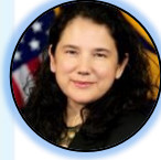
Isabel Casillas Guzman Entrepreneur & Small to Mid-sized Business Expert